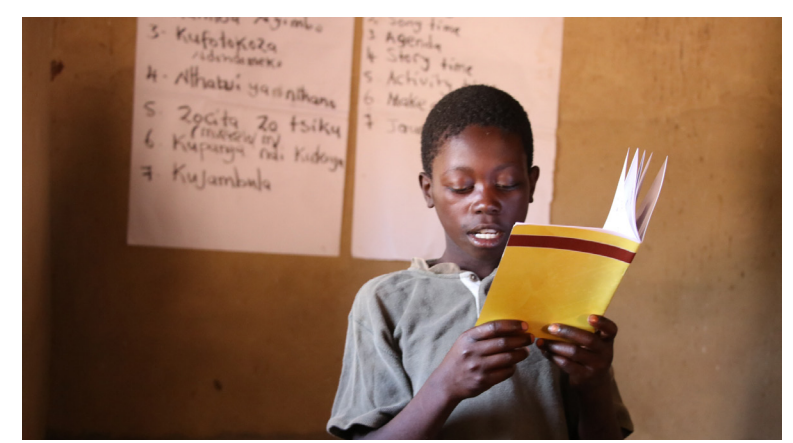
Rabson participating in Unlock Literacy Reading camp in Nyimba District, Eastern Province

3. Community Action - Comprised of two main activities, the Reading Awareness Workshops for parents and Reading Camps which are weekly sessions for Grades 1-4 students who live in the same communities. Reading Camps are designed to be outside school learning sessions to complement what children learn in school and in addition develop a love for reading. In some cases, out of school children have also joined reading camps. Reading Camps are managed by RCFs who are trained by World Vision Zambia. We have currently established 1,071 Reading Camps and trained 710 RCFs. 5,482 parents were trained in Reading Awareness workshops. This equipped parents and caregivers with knowledge and strategies to support their children's literacy development more effectively.