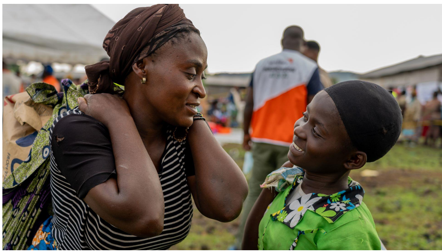
1The renewed fighting between the Democratic Republic of Congo Forces and the M23 has displaced more than 340,000 people since March. World Vision has provided food, nutrition services, water collection, water storage and water treatment supplies to help alleviate the impact of the humanitarian crisis.

Sources: *UNOCHA - Humanitarian Response Plan *UNHCR March 2022 *UNICEF