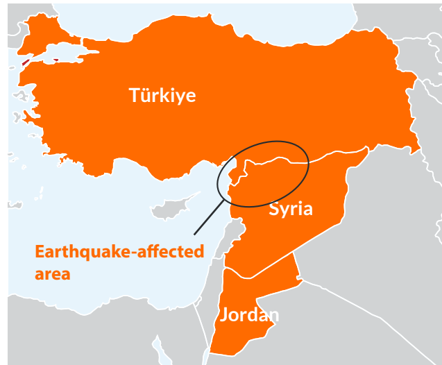
Map of World Vision Syria Response countries – showing earthquake-affected area