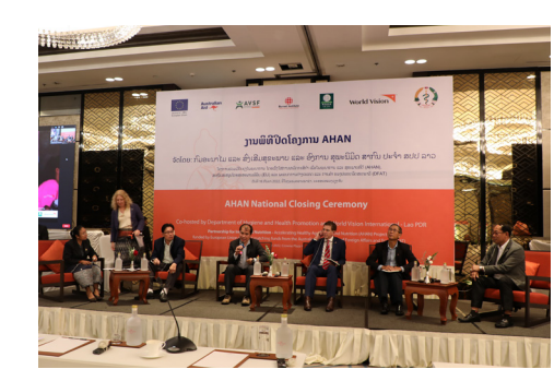
Vientiane Capital, 16th of September 2022.

The National Closing Ceremony of the Accelerating Healthy Agriculture and Nutrition (AHAN) Project was held at Crowne Plaza.