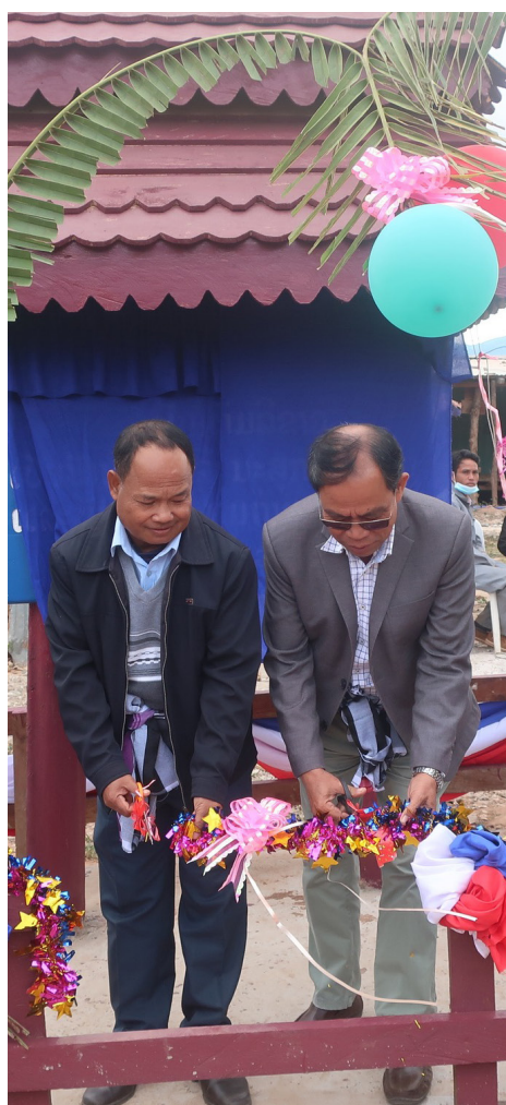
Sanitation for all in Saravane province!

Four villages from TaOi district supported by AHAN ANCP were declared Open-Defecation Free on Dec 19, 2022.