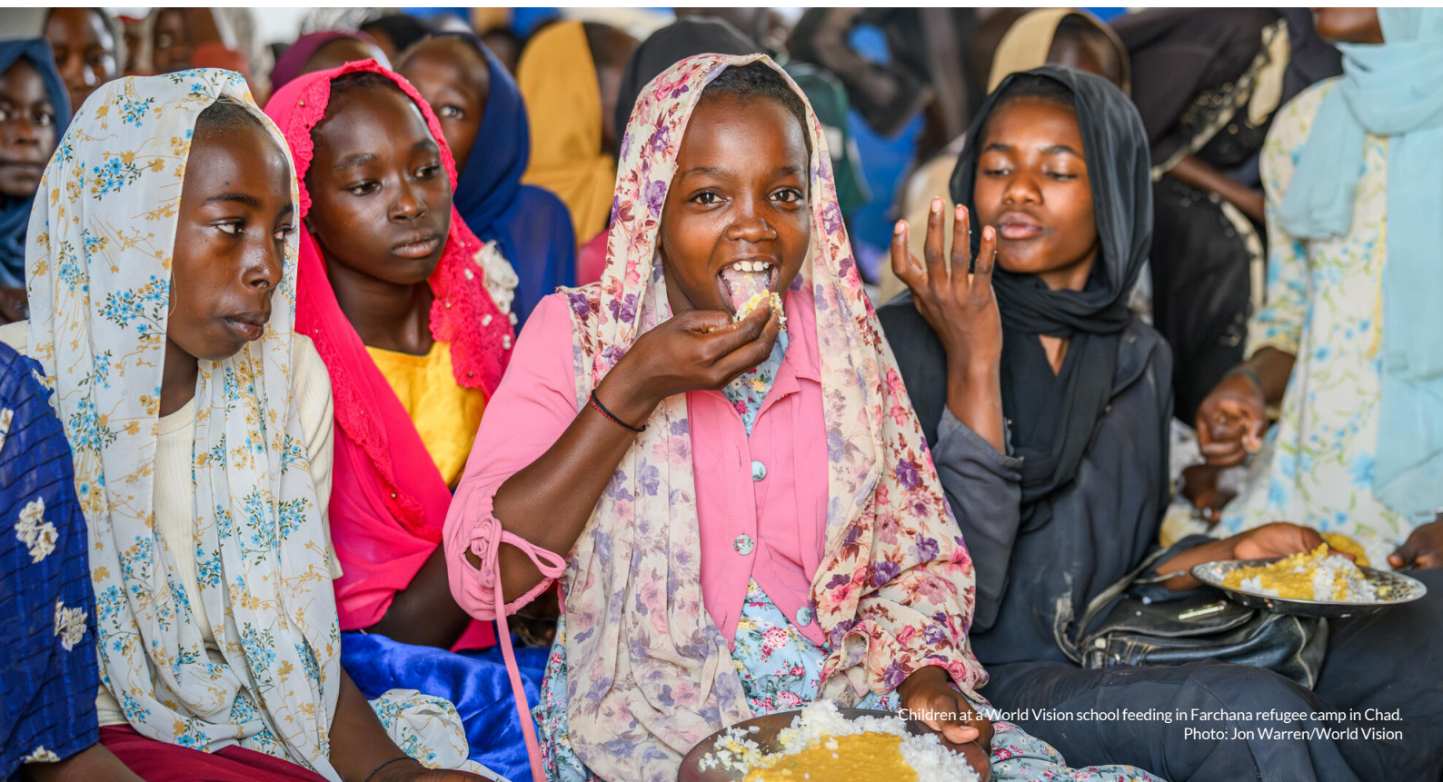
Children at a World Vision school feeding in Farchana refugee camp in Chad.