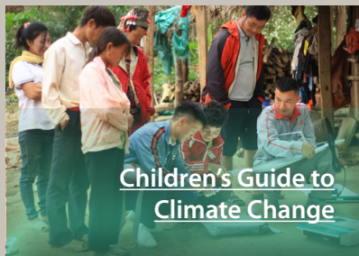
Children's Guide to Climate Change