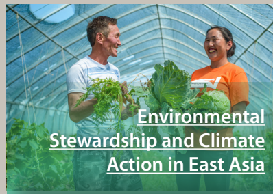
Environmental Stewardship and Climate Action in East Asia