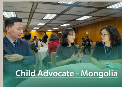
Child Advocate - Mongolia