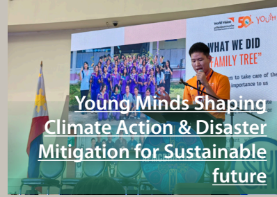
Young Minds Shaping Climate Action & Disaster Mitigation for Sustainable future