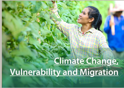
Climate Change, Vulnerability and Migration