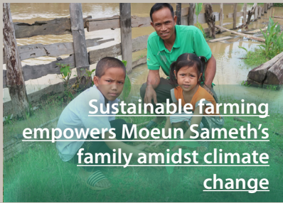
Sustainable farming empowers Moeun Sameth's family amidst climate change