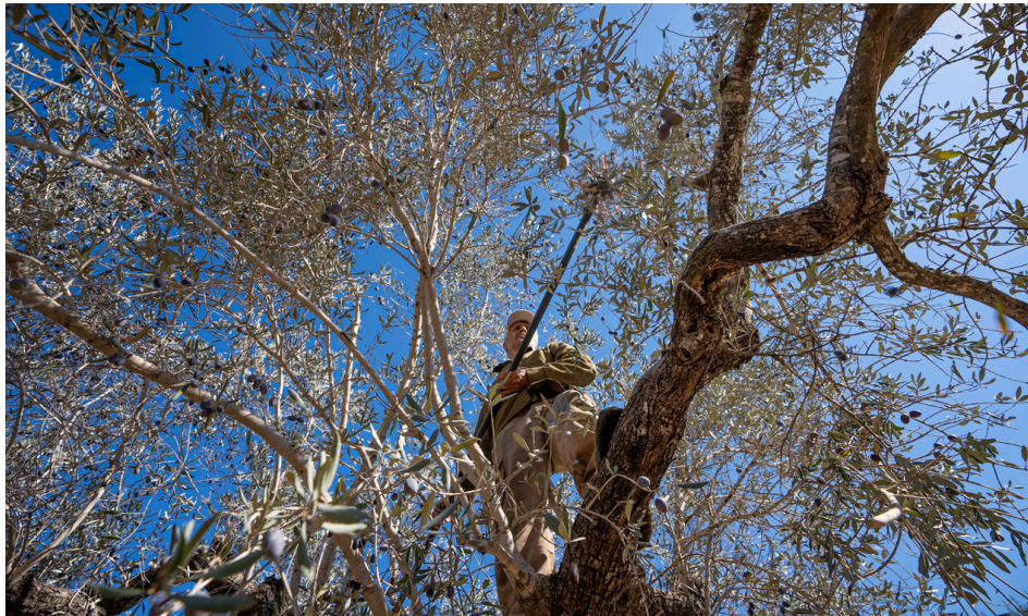
A farmer is harvesting olives in the north of the West Bank.