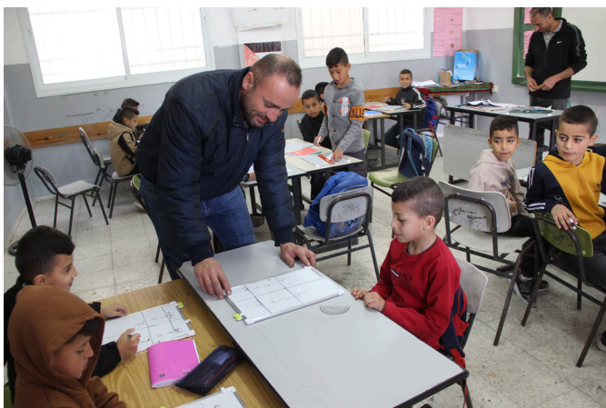
A teacher is providing catch up classes for students who have been impacted by school closures in the West Bank.