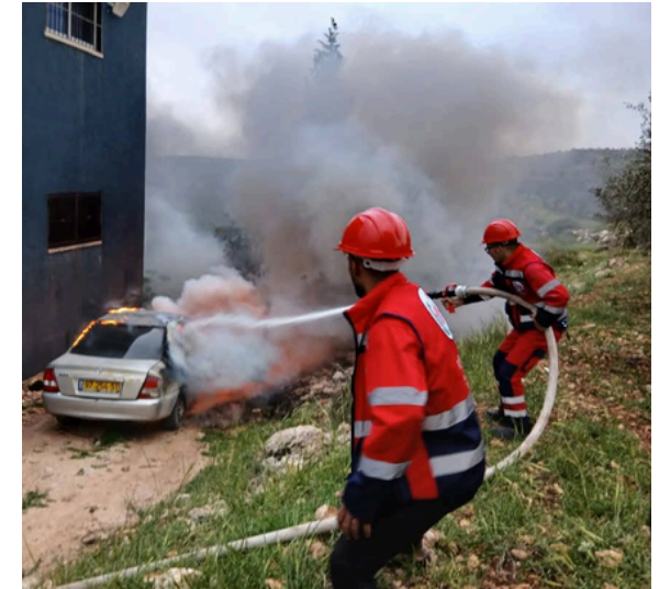
Local volunteers use material provided by World Vision to put out a fire following violence in a village of the central West Bank.