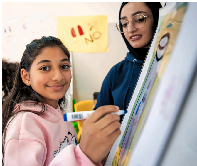
A girl is taking part in a mental health and psychosocial support session for adolescents in the West Bank.