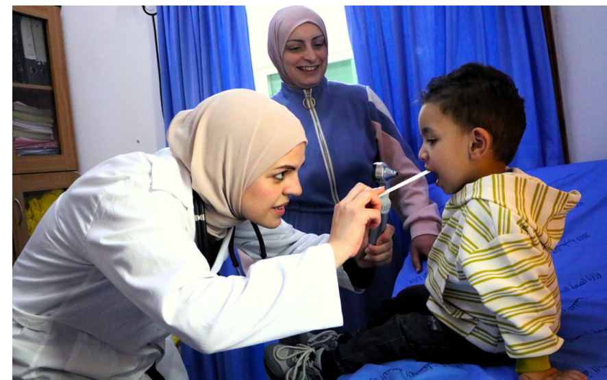
A doctor is treating a young child in a health clinic in the South of the West Bank.