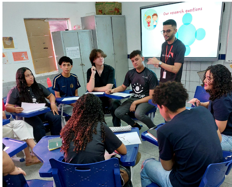
In-person workshop for child-led research on school meals in Brazil