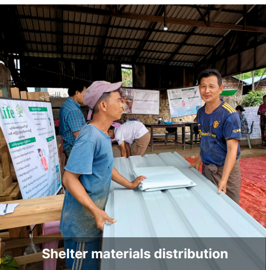
Shelter materials distribution

benefited from recovery loans amounting to 440,366 USD by VisionFund