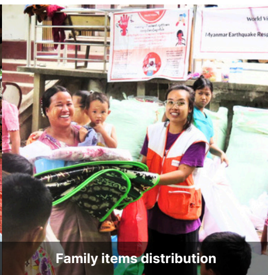
Family items distribution