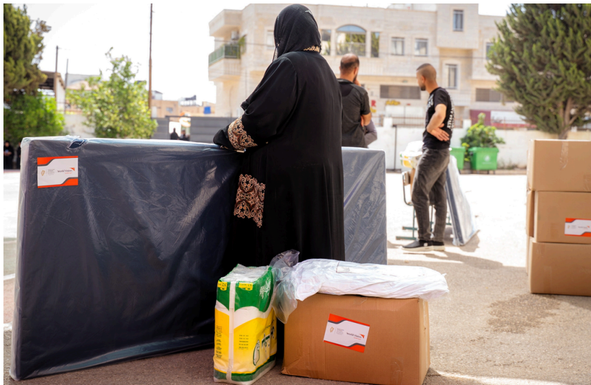
A distribution of non-food items in the north of the West Bank