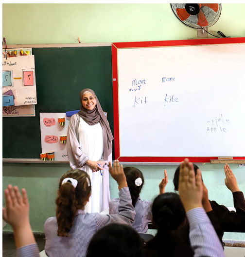
A teacher is providing catch up classes for students who have been impacted by forced displacement in the north of the West Bank.