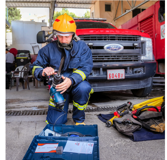
A member of Civil Defence in the Jordan Valley is unpacking a new tool provided by World Vision