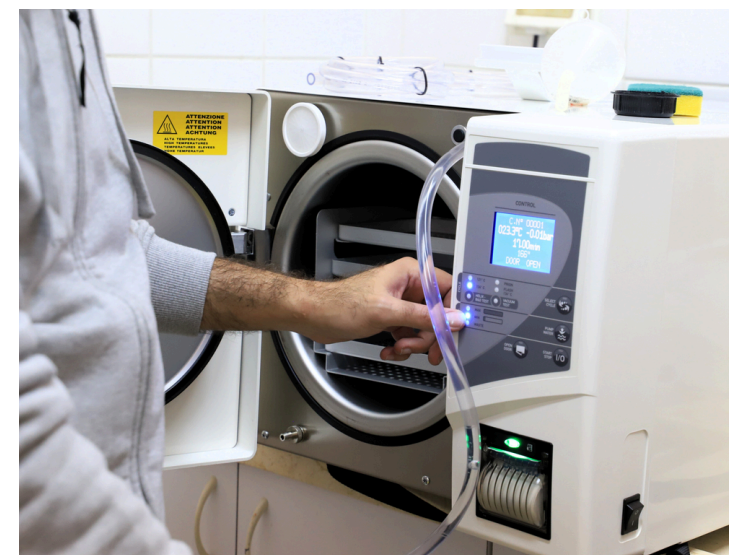
A new tool for sterilization (autoclave) is being set up in a health clinic supported by World Vision in the West Bank.