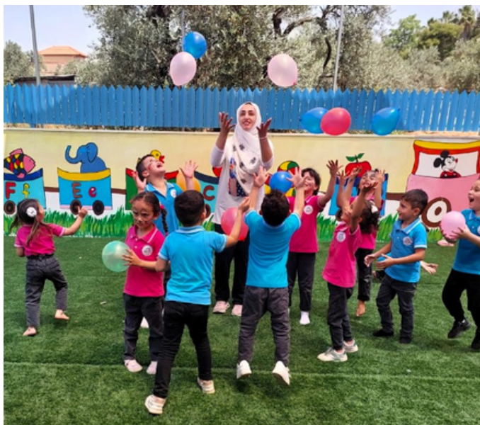
Children are taking part in a psychosocial session to help them to deal with stress and anxiety.