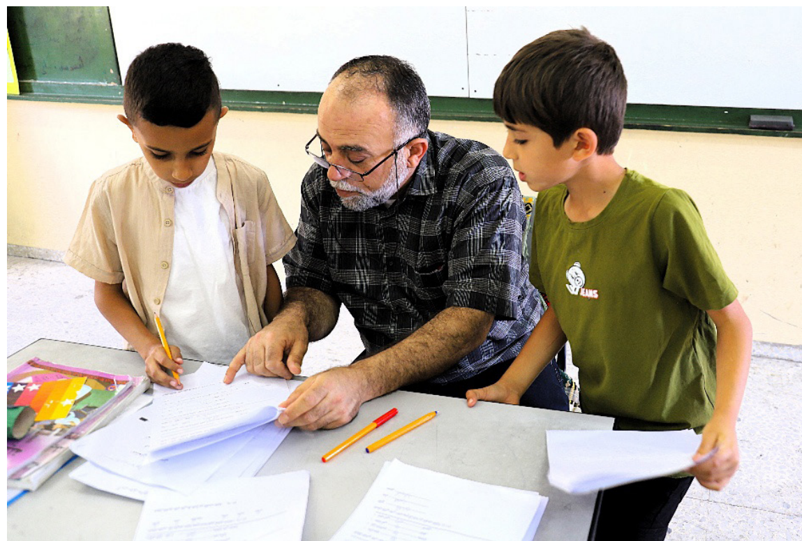
Photo: A teacher supports children during a catch-up class

“Education is not a privilege; it is a fundamental right essential for building a future full of hope and resilience” Nersyan, 16-year-old student