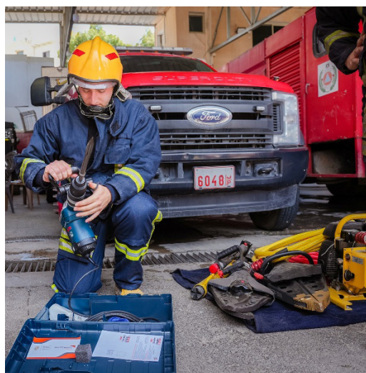
Photo: A firefighter tests new equipment provided by World Vision in the north of the West Bank

Since October 7th, 2023, communities across the West Bank have faced an unprecedented surge in violence, resulting in numerous casualties and widespread destruction. Homes have been set alight, while shops, crops, olive trees, and vehicles have been destroyed, dealing a severe blow to the livelihoods of thousands. The presence of hundreds of checkpoints, roadblocks, and other barriers has made movement nearly impossible – even in emergencies. This has also severely hindered the ability of emergency services – including firefighters and ambulance crews – to respond in a timely manner. In some instances, they have even been targeted while attempting to carry out their duties, further preventing them from fulfilling their life-saving work.