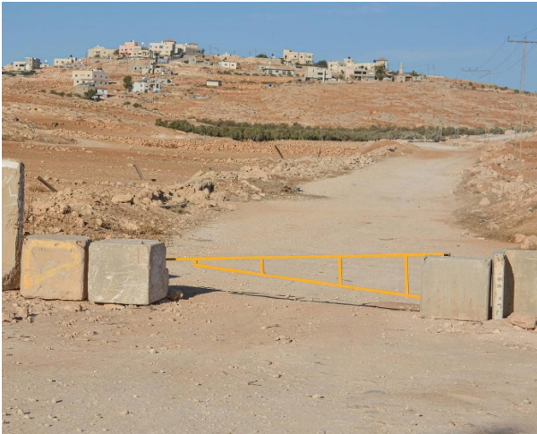
Photo: A barrier that prevents access to a village in the south of the West Bank

Since October 2023, the Palestinian Authority has lost much of its financial income, leading to a severe liquidity crisis that has drastically curtailed its ability to pay civil servants' salaries. This, in turn, has had a serious impact on the provision of essential public services. Primary and secondary schools are now offering face-to-face education only three days a week at most, compared to the usual five. Making matters worse, most local health clinics are operating just one day a week and have extremely limited supplies of essential medicines. The crisis has been further deepened by the breakdown in cooperation between local banks and Israeli institutions, exacerbating the liquidity shortage for Palestinian authorities, businesses, and families alike.