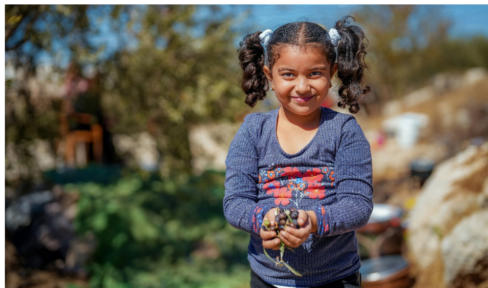
Photo: A young girl smiles during the olive harvest in the south of the West Bank. (Credit: World Vision)