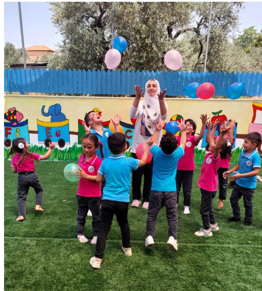
Photo: Children take part in a psychosocial support session in the West Bank