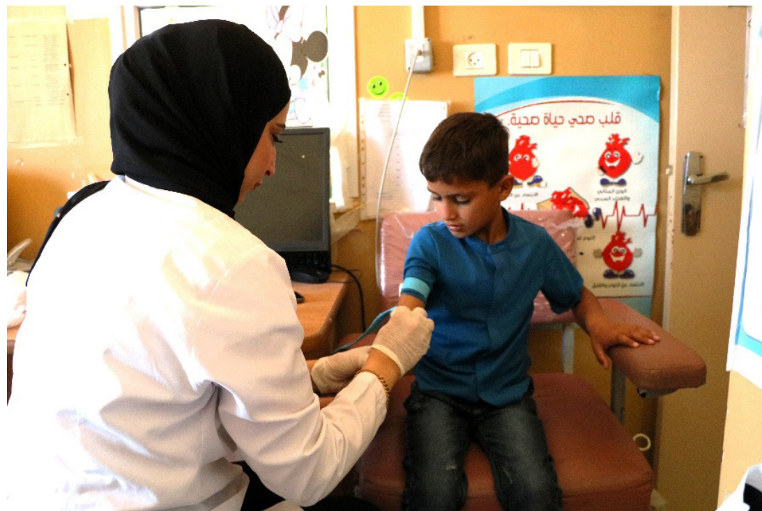
Photo: A child receives health care in a clinic supported by World Vision