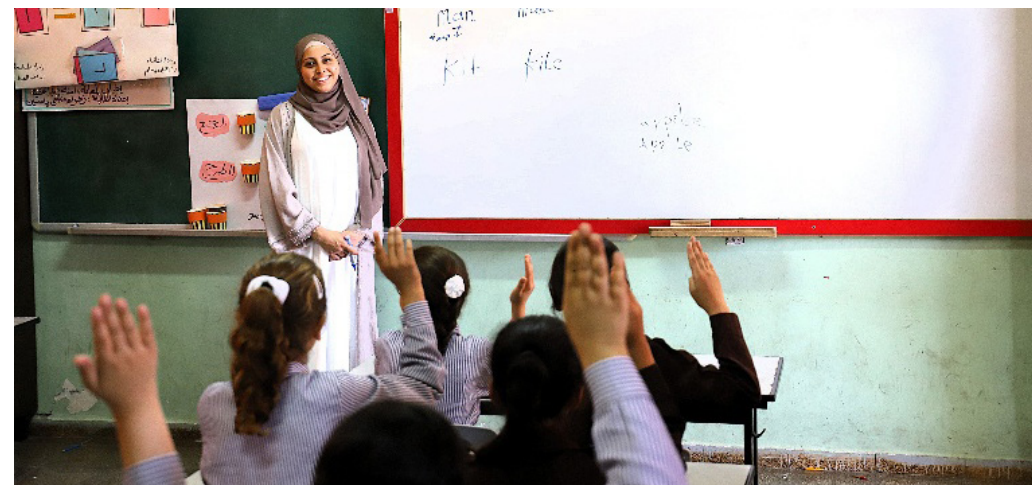
Photo: A teacher facilitates a catch-up class for children displaced by violence in the north of the West Bank