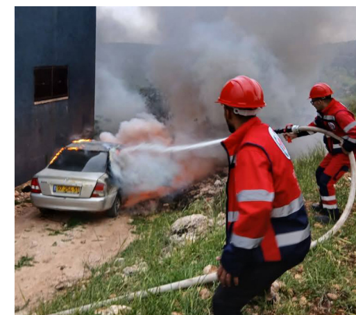
Photo: A group of local volunteers respond to a fire using material provided by World Vision in the central West Bank (credit: Local Volunteers, central West Bank)

Since October 2023, World Vision has provided over US$ 1.5 million in lifesaving tools to support local first responders. These included advanced first aid kits and firefighting equipment – such as ladders, fire beaters and fire extinguishers – which were distributed to 200 villages to enhance their capacity to prepare for and respond to emergencies. This support included the provision of 12 firefighting trailers that have allowed local volunteers to save lives on multiple occasions. Twenty Civil Defence centres were also provided with life-saving equipment, such as hydraulic cutters, circular saws and hoses.