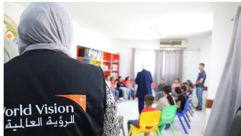
Photo: A world Vision's staff observes a psychosocial support session with children in the central West Bank (Credit: World Vision)