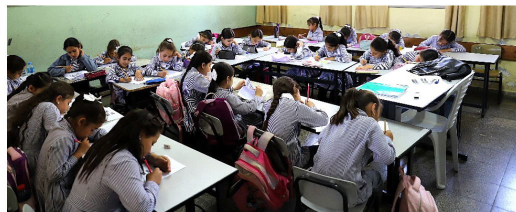
Photo: Students writing quietly during a catch-up class (Credit: World Vision)

In the West Bank, schools have not been spared from violence. Hundreds of violent incidents have affected schools, teachers, and students over the past two years. The combination of violence, movement restrictions, and an ongoing fiscal crisis has resulted in reduced face-to-face education, school closures, and significant learning losses impacting girls and boys of all ages.