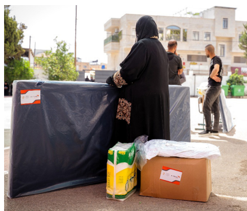
Photo: More than 44,000 people were displaced in the north of the West Bank. They often had to leave with nothing.

Many families in the West Bank have lost everything due to intensifying violence and ongoing forced displacement. As the economic crisis deepens, nearly 1 in 3 jobs have been lost, leaving both male and female-headed households without any stable source of income. Two years into the crisis, there is also growing evidence of food insecurity among families and children impacted by this crisis.