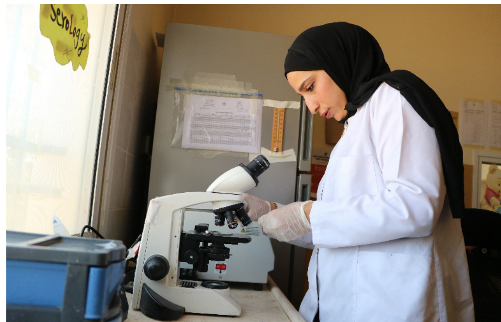
Photo: A doctor uses a new microscope provided by World Vision. This equipment ensures that local health clinics can continue providing essential services to children and families (Credit: World Vision)