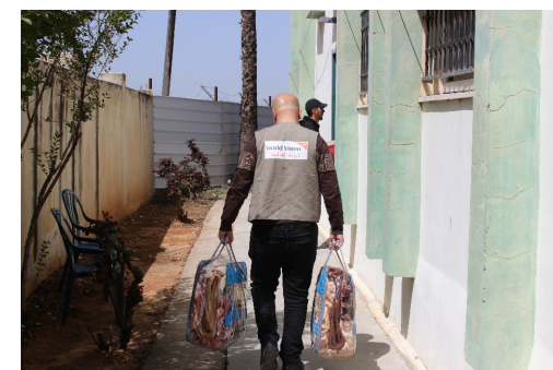
Photo: A distribution of blankets to vulnerable families in the West Bank

With the aim of addressing growing economic needs, thousands of vulnerable families affected by poverty and food insecurity were identified through partnerships with local village councils and other organizations. World Vision International used a gender-responsive approach to identify the beneficiaries, prioritizing pregnant and lactating women, women with toddlers or young children, as well as single mothers.