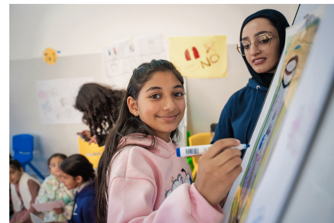
A child is taking part in a psychosocial support session