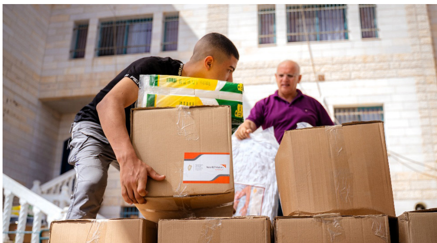
Photo: A family displaced by the ongoing violence receives emergency support in the north of the West Bank

Over the past two years, the humanitarian situation in the West Bank has worsened dramatically. Communities are facing ever-tightening restrictions on movement, rising levels of violence, and deepening economic hardship. What was already a fragile daily reality has become increasingly unbearable for many families, as essentials like food, clean water, shelter, and healthcare are getting harder to access.