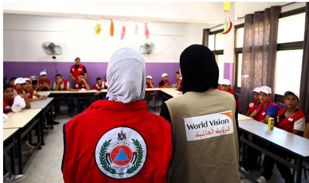
Photo: A World Vision's staff with a volunteer firefighter is leading an emergency preparedness session in a school

Every child deserves to feel safe, to learn, and to grow up healthy. Without urgent action, an entire generation of children in the West Bank risks growing up knowing only hunger, fear, displacement and lost opportunities. Together with affected communities, World Vision will continue working to restore hope and dignity, giving every affected child a chance at a better future.