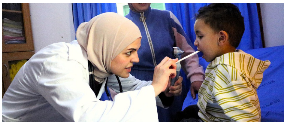
Photo: Restrictions on movement, budget gaps and poverty, have seriously reduced access to health care for many families in the West Bank