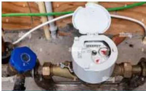
Damaged water meter