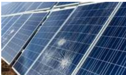
Damaged solar panel

The Insurance Scheme for Water Facilities is an innovative solution designed to mitigate operational and environmental risks faced by rural and small-town water systems. The scheme protects both infrastructure and service continuity by covering critical risks like mechanical breakdowns, borehole collapse, and theft of parts. The scheme was developed in partnership with local insurers, donors, and community leaders, the Regional Co-ordinating Council, Community Water and Sanitation Agency (CWSA). Ahafo Regional Coordinating Council and the private sector in a co-creation process. It supports water service providers to recover faster after earthquakes, reduce downtime, and maintain trust with communities.