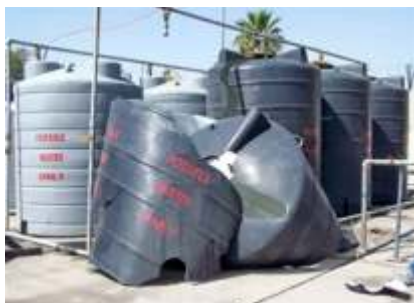
Damaged solar panel