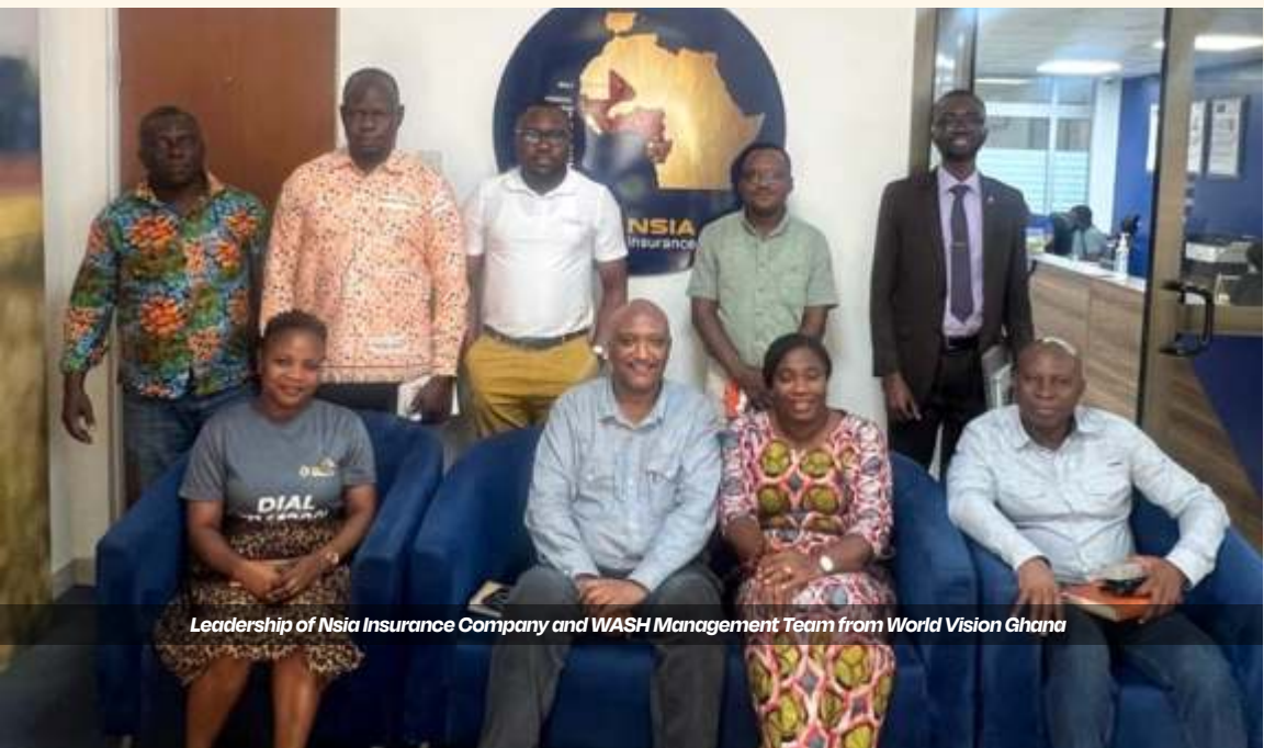
Leadership of Nsia Insurance Company and WASH Management Team from World Vision Ghana