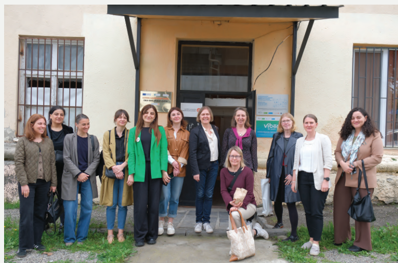
Hosting the delegation of Sweden to the WVG office in Kakheti

We are proud of the significant progress in collective empowerment: food-secure households rose from 53% to 88% , access to social protection increased from 45% to 80% , and households with additional income grew from 66% to 84% .