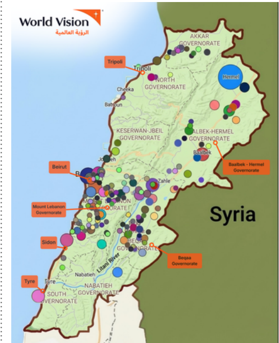
WVL Operational Footprint Day 1-45

Humanitarian needs remain severe, with most displaced populations residing outside collective shelters and facing limited access to assistance, vulnerabilities continue to deepen. Humanitarian actors continue to call for the protection of civilians and civilian infrastructure, safe humanitarian access, and urgent international support .