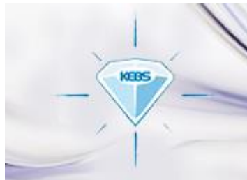
Diamond Mark of Quality