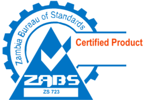
The Product Certification Mark

ZAMS authorizes the use of the Product Certification Mark for products that meet the corresponding standards.