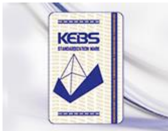
Standardization Mark Quality

The Import Standardization Mark of Quality is required for all imported products intended for sale in the local market.