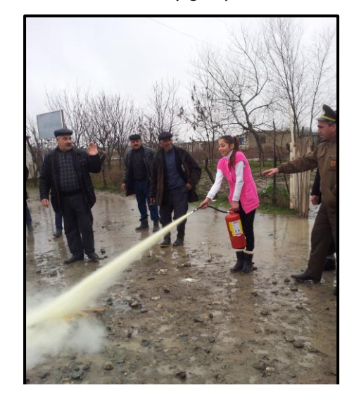
Training and simulation in school with local Disaster Management committee – Jan 2013

Proposals were submitted by 14 communities and 10 schools including the following projects: