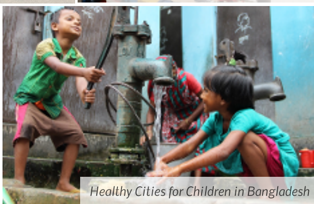
Healthy Cities for Children in Bangladesh