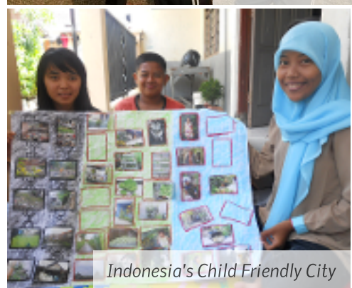
Indonesia's Child Friendly City