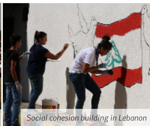
Social cohesion building in Lebanon