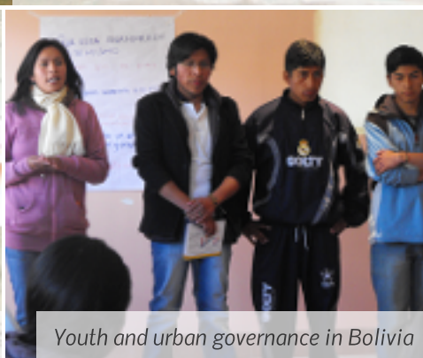
Youth and urban governance in Bolivia