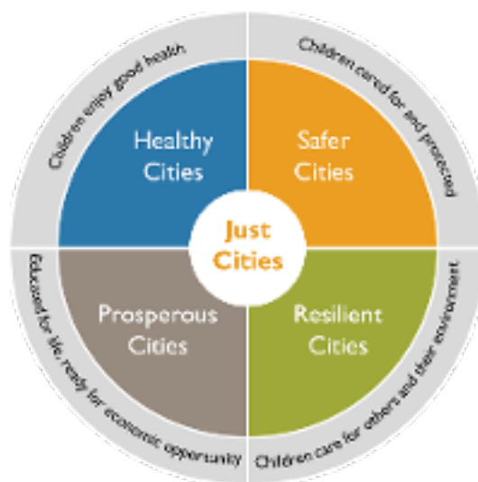
World Vision's Cities for Children Framework