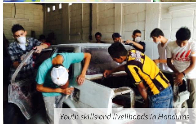
Youth skills and livelihoods in Honduras