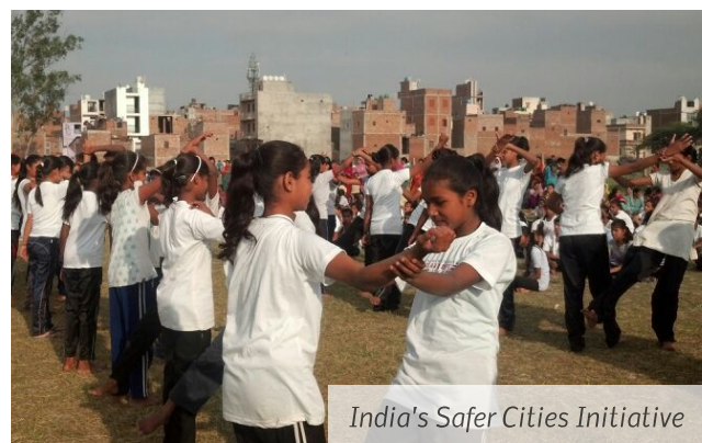
India's Safer Cities Initiative