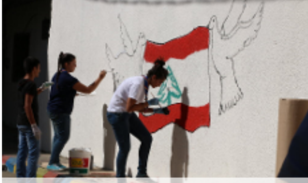
Social cohesion in Beirut, Lebanon

Youth skills training inTegucigalpa, Honduras