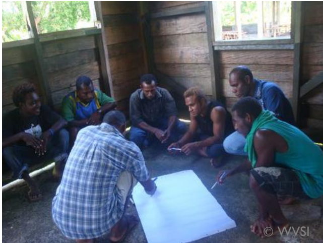
Weather Coast community members working together to stop gender-based violence.

Two Weather Coast area communities included in the study have had surprisingly positive results – including successfully negotiating with narcotic growers and suppliers to either destroy their own plants or stop the circulation of drugs.