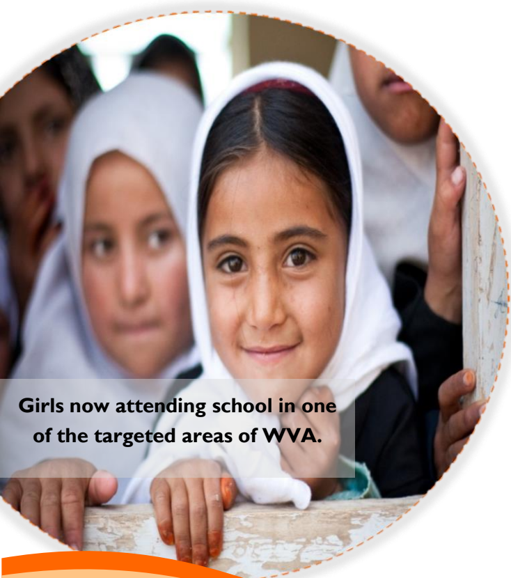
Girls now attending school in one of the targeted areas of WVA.

Training for youth. This program has provided literacy classes, life skills and vocational training for 1,200 young women and men aged between 15 and 25 who could not benefit from formal education. Those who have graduated from the classes now run their own businesses and support their families. We are not just providing training and literacy classes for them, but the program has also empowered them to learn core marketing skills to sell their products in the market.