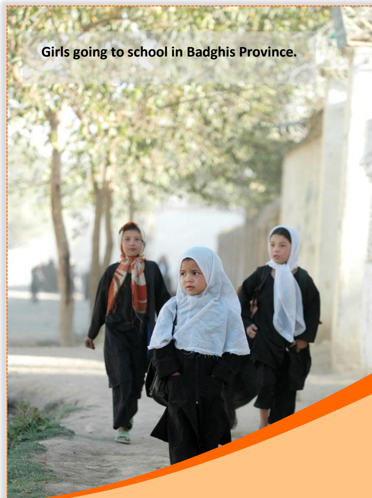
Girls going to school in Badghis Province.

Our education program is ensuring the sustainability of its activities through making targeted populations aware of the importance and benefits of child education. In addition, we are working with local community leaders and others to advocate for such education activities to be included into the learning systems of primary schools and mosques, and for including remedial education services for street children in their budgets.