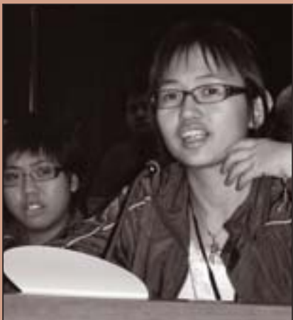
A Chinese child raises questions during the consultation.

“Most people ignore it or are unaware of it”