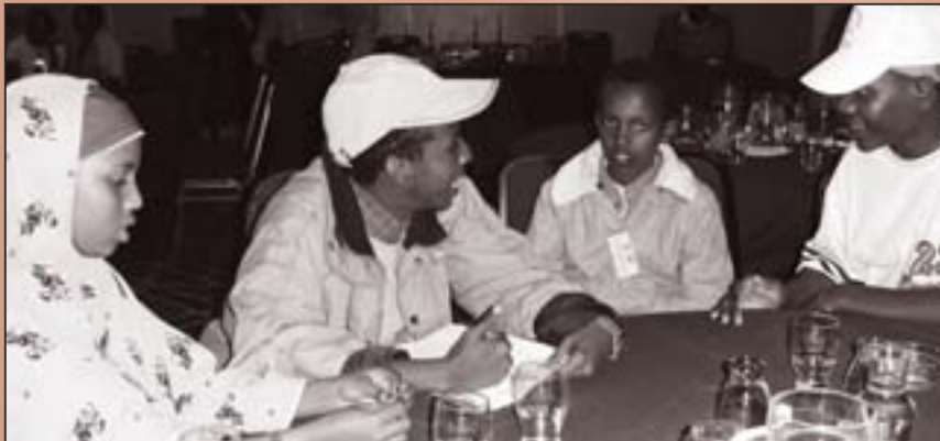
Discussions between Somali children, their chaperone and a parliamentarian from Malawi.

“The UN Secretary-General’s Study on Violence Against Children is an important opportunity to find out what children are doing about the violence that they experience. It is also a chance to hear about ideas that children have to prevent violence. As a step to achieve this, regional consultations have been organised throughout the world so governments, organisations and children can come together and discuss issues about violence... you will have the chance to meet and get to know the other children and also talk about violence against children.”