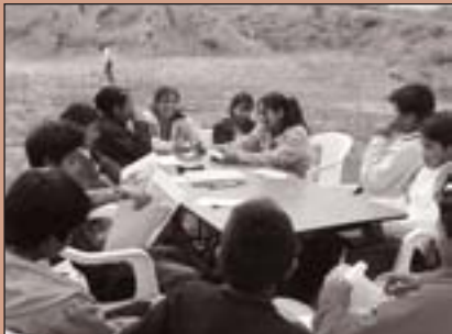
Mexican children participating in a discussion about violence

IN PREPARATION FOR THE LATIN American Regional Consultation of the UN Study on Violence Against Children, 1,790 children and adolescents in 17 Latin American countries participated in a consultation to gather their views on violence. These young people took part in 208 focus groups of between seven and 12 participants, some comprising children aged 9–11 and others children aged 15–17.