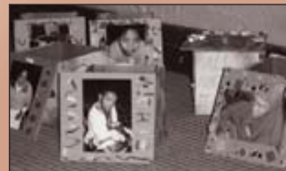
A display of boxes with children’s pictures – to remind the adults of the children and what they had recommended