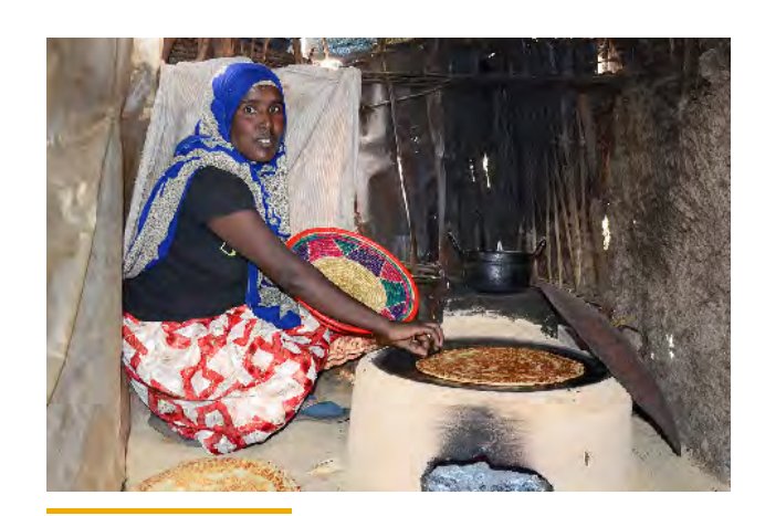
Clean cooking possible with improved cook stove (Energy Efficient Stove Project)