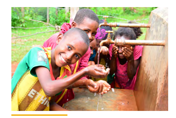
Improving access to clean water