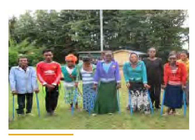
Children with disabilities (CWD) supported with crunch