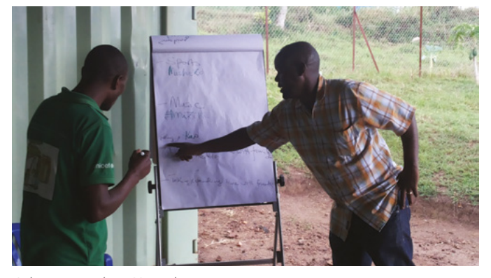
Adapting tools in Uganda

An important aspect of adaptation is also contextualising the language used in a tool. This can involve revising the language of questions to fit with local patterns of speech (e.g. colloquialisms), framing questions so that they match with contextually specific events, and conveying meaning of questions in easy-to-understand language.