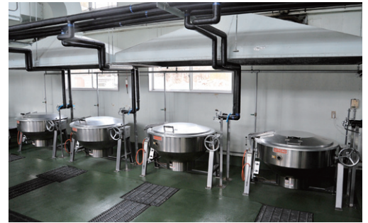
Cooking equipment installed at the restored school meal centre