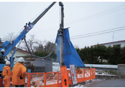
Wells under construction