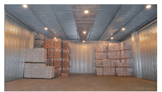
Post-repair, the Kesennuma freezer warehouse will eventually be able to store almost 170,000 tonnes of fish and seafood.