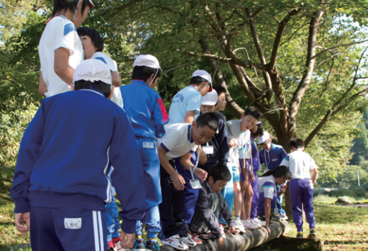
Children enjoying playing outside, without fear of radiation