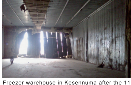
March tsunami tore through the city

Bringing business back to Kesennuma is essential to help fishermen and their families keep the fishing industry going. As part of a re-branding campaign, World Vision helped with messaging and production of 40,000 stickers. Dealers and distributors used the stickers on stock issued to other parts of the country.