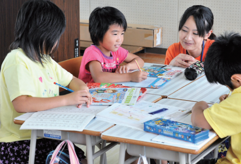
Children studying at the Child Friendly Space

World Vision provided essential household items to 13,343 people residing in temporary houses.