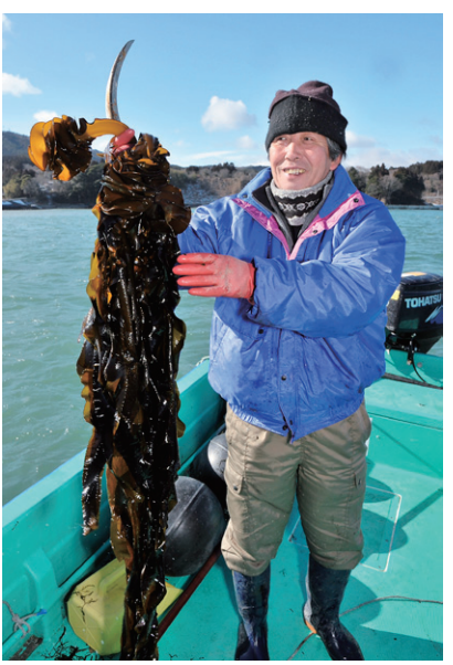
A fisherman cultivating wakame (seaweed) by using a small boat provided by World Vision