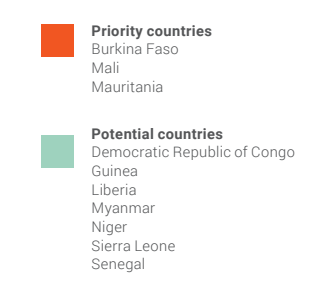
Figure 3: Map of priority and potential countries for deployment

<sup>1</sup> Myanmar included due to the current humanitarian situation and increasing levels of displacement and food insecurity. Acute Malnutrition affects 7% of the population. In Rakhine, it is estimated that 80,500 children under the age of five are expected to be in need of treatment for acute malnutrition within the next 12 months. (World Food Programme, "Food Security Assessment in the Northern Part of Rakhine State." 2017.)