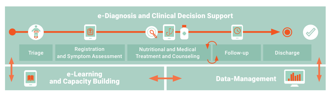
Figure 2: Project Components

Real-time data collection will result in data being readily available for district health management teams for decision making and program improvement.