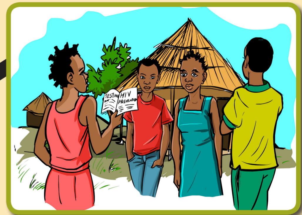
Expanded prevention model – Empowerment of youth

Reduced incidence of HIV among women of reproductive age, exposed children and improved survival of HIV positive mothers and children