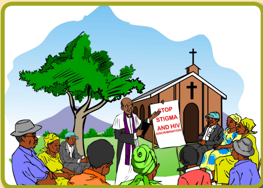
Channels of Hope model— Stigma and discrimination