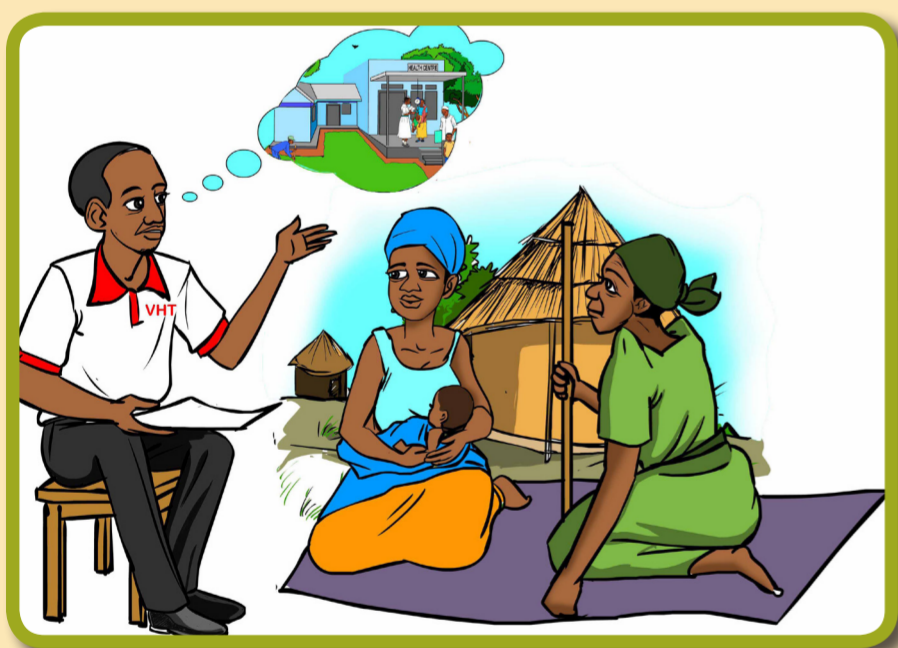
Timely and targeted counseling model— Identification and linkage of HIV positive mothers into EMTCT cascade