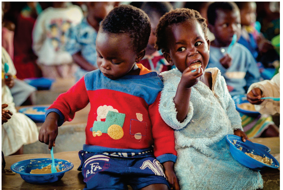
Community based child care centre, Malawi