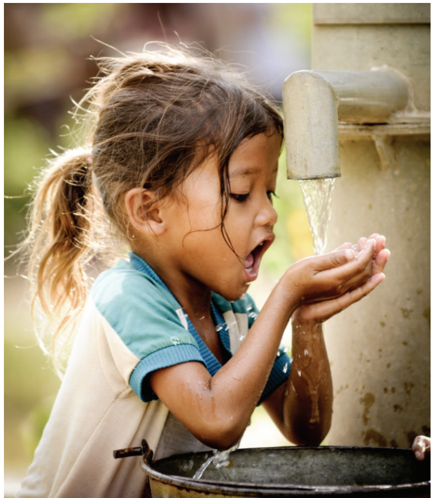
World Vision–sponsored child enjoying the water from a newly installed well, Cambodia

In the first instance, governments themselves must meet the highest standards of accountability. Social accountability mechanisms that can equip government and citizens to work constructively together are a critical component for improving performance on essential services. 34 World Vision is currently supporting more than 300 programmes in 34 countries to implement the Citizen Voice and Action approach to social accountability. The tools in this approach include score cards, social audits, and public expenditure tracking along with interface meetings (between government and communities) to encourage dialogue and debate. Together, these interventions serve to strengthen the accountability relationship between governments and their citizens.