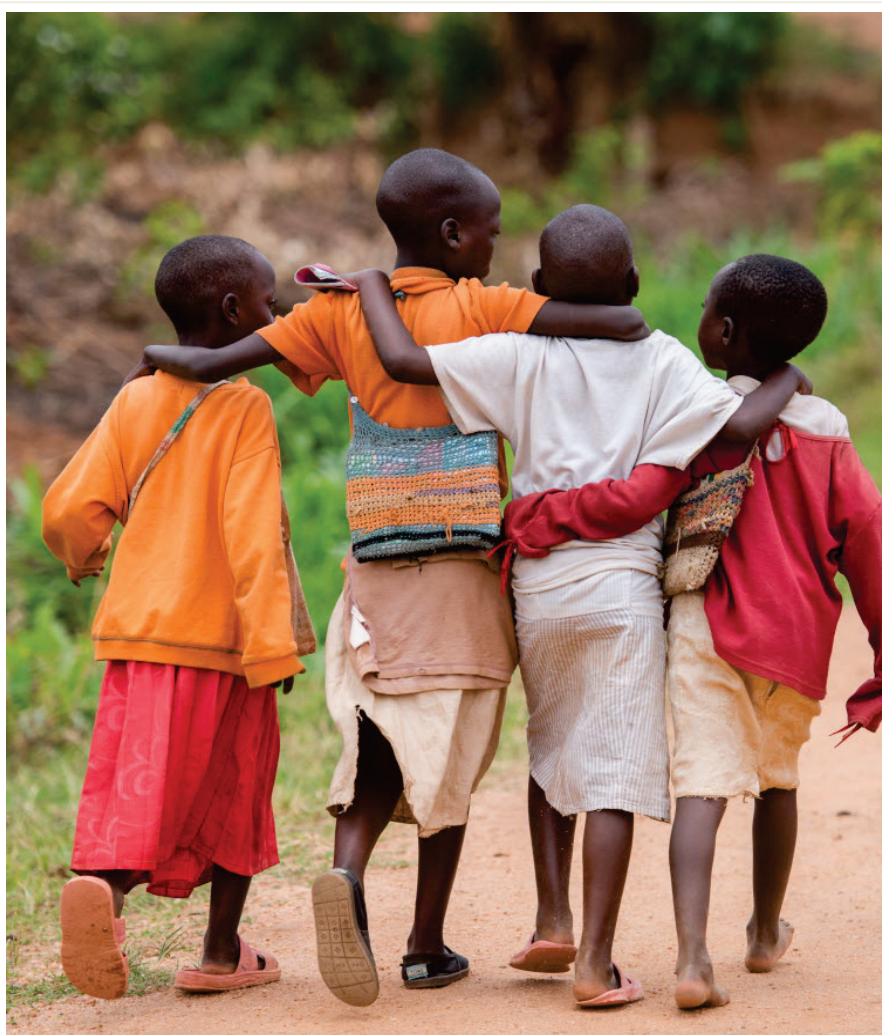
Friendship, Rwanda 2014

Please note that, unless otherwise stated, the proposed recommendations made throughout this paper are World Vision's and do not necessarily represent the views of the individuals or organisations interviewed for this study.