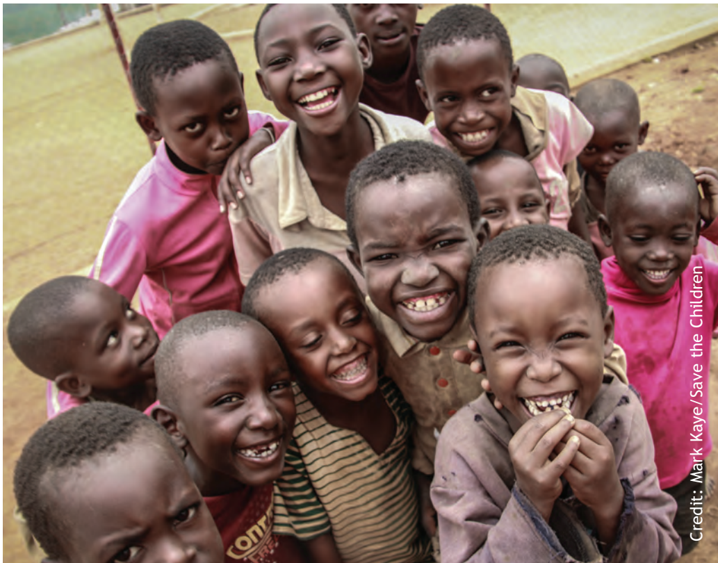
Children playing in Mahama Refugee Camp in Rwanda

Some countries, however, lack the capacity or the will to address the problems children living in poverty face. Ensuring stable state capacity and effective institutions is the fundamental solution, but childhood does not wait for the long term. Humanitarian agencies, supported by donors, alongside state institutions can help protect children in crisis. Interventions can include child-sensitive social protection, school feeding, as well as ensuring children have access to schooling and health care. Early intervention is important for children’s development, alongside later investments to remediate early under-nutrition 18 and support to help children back into schooling.