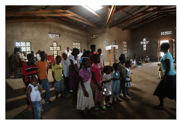
Pastors deployed many mobilization strategies

Some of the pastors identified their remit for CP to pertain only to their congregations and restricted themselves to these. This meant that they focused all activities only on those who are part of their church and worked with structures and individuals in these. Interestingly, some of these pastors belonged to the first group above, who potentially could have had influence beyond their congregations. Other pastors interpreted their task as pertaining to all of their community regardless of whether families belonged to their congregations or not.