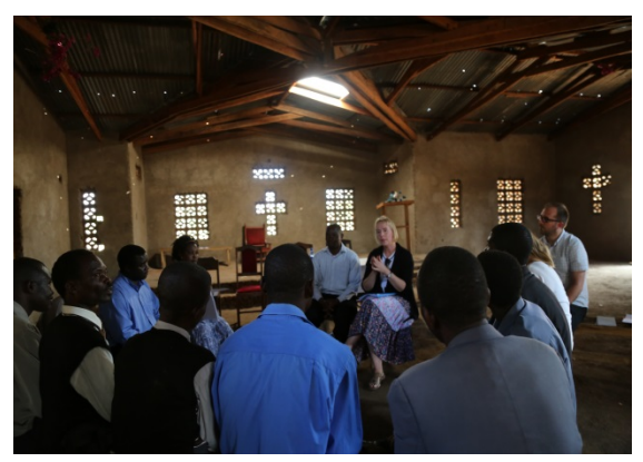
Meeting with Pastors Fraternal in Chingale

The powerful way in which child protection issues had been addressed during the workshop seemed to have had a life changing impact for some of the participants. Particular mention was made of two exercises during the workshop: the 'balloon game' and the collecting and placing of stones under the cross.