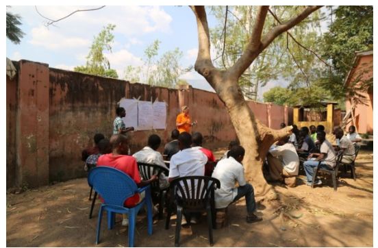
FGD with a youth group in Chingale

interviews with other local stakeholders. Nine focus group discussions (FGDs) were conducted with community groups, including three FGDs (involving approximately 30 boys and 30 girls) with children. Details of the groups and participants interviewed are given in Annex A.