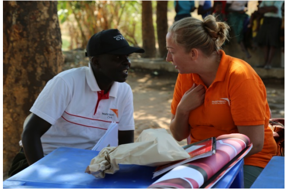
Discussion with CVA Chairperson

With the simultaneous roll-out of the Citizen's Voice and Action (CVA) programme, the attribution of these changes is challenging. However, the broader lesson appears to be the benefits of coordinating and integrating such initiatives. For example, there was evidence of CVA mobilization in one community regarding the establishment of a local bye-law proscribing child marriage where advocacy by faith leaders had played a key role. In another instance, a participant of the CoH CP workshop reported seeing health and education personnel identified through CVA work as the appropriate drivers of change for the initiatives they planned, rather than a CHAT group. This participant was a senior women's leader in the Catholic church and sought to identify collaborators with whom she could work in order to address CP more effectively. She formed an effective 'working group of three': one of the CVA health promotors, a teacher and herself.