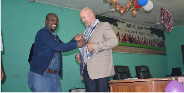
Chief Admin of S. Omo zone presenting traditional hand woven scarf as honorary gift to WV Ethiopia ND

World Vision Ethiopia opened two new Area Programs (APs) in South Omo Zone of the South Nations Nationalities and Peoples Regional State. The APs will operate in four districts; namely Benna-Tsemay, Salamago, Malle, and South Ari with an initial budget of US$ 839,253 secured from various sources to implement education, sanitation and hygiene, livelihood, and health projects in the years 2017 and 2018.