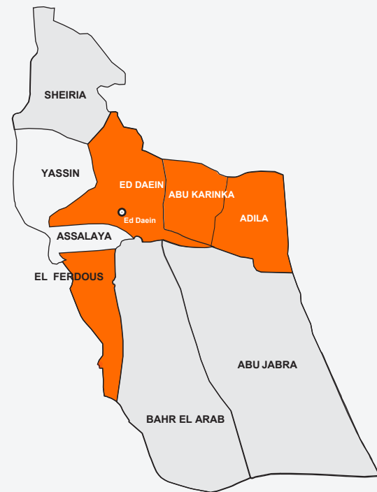
Highlighted in orange: Localities where World Vision is currently operating.