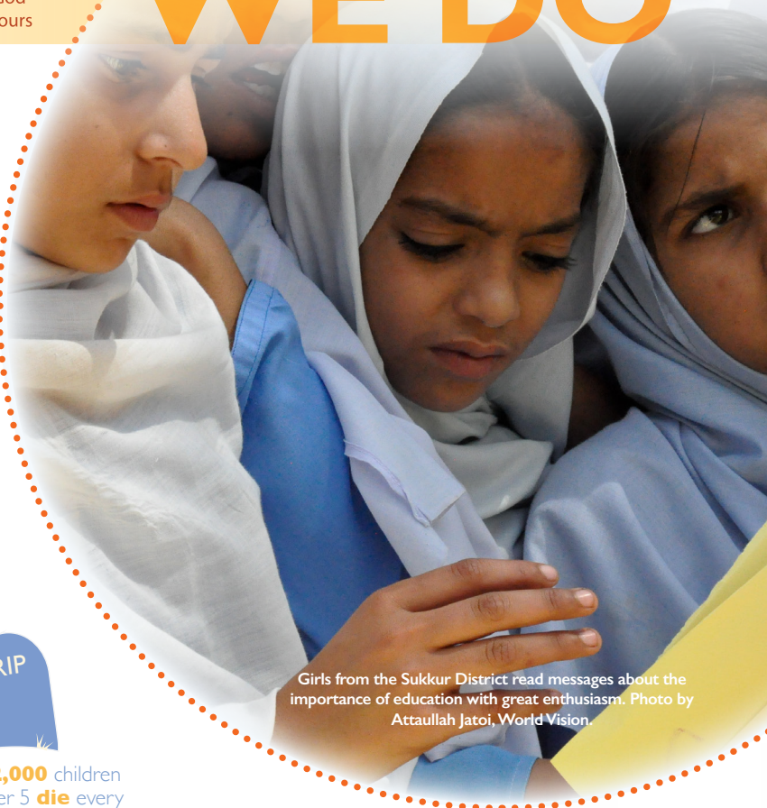
Girls from the Sukkur District read messages about the importance of education with great enthusiasm.