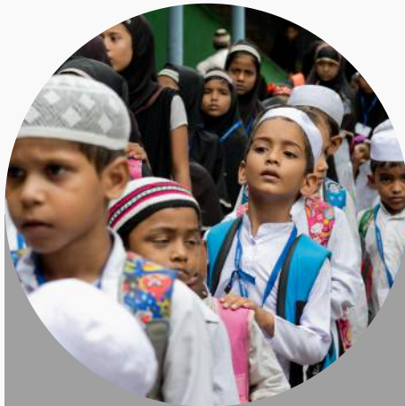
School safety and personal safety training, conducted by World Vision, at a Madrasa in Kolkata, India.

Preparedness activities include, comprehensive evacuation drills, child-focus education activities, teacher trainings, establishing and strengthening school early warning systems, facilitating the formation of participatory disaster management committees, organising safety for school promotional campaigns, investing in fire fighting equipment, creating preparedness plans, as well as developing and distributing different DRR tool-kits and materials.