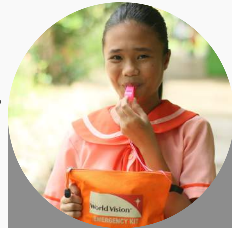
World Vision complements the teacher's efforts by providing emergency kits to the students in Philippines.

To further boost the sustainability of the school safety initiative in various countries, at the policy and systems level, World Vision provides technical support to build the capacity and preparedness of national and local governments and civil society organisations.