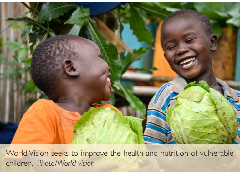
World Vision seeks to improve the health and nutrition of vulnerable children.