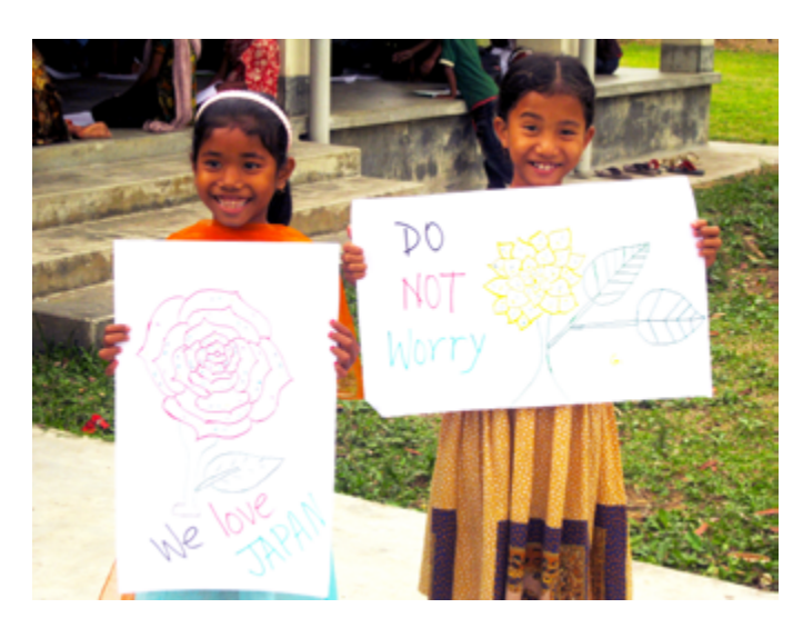
Sponsored children in Bangladesh show their messages of support for Japan

In March 2011, World Vision was thrust into the unusual position of responding to an emergency in Japan - a country that is normally the source of generous contributions to our work in developing countries.